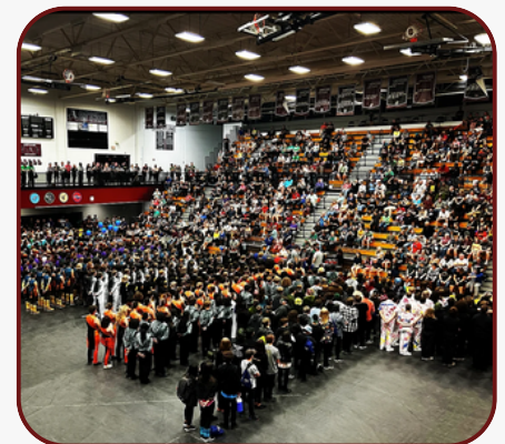
2023 GIPA Championships at AHS

You will be blown away by the talent and skill of these percussion shows!